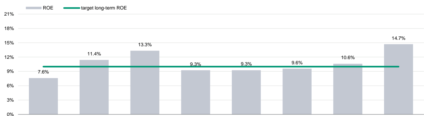
SpareBank 1 Østlandet's Moody's adjusted Return on Equity (RoE)

We expect the bank's recurring profitability to be sustained in 2020-21, with the contribution of cost synergies already in place estimated by the bank at minimum NOK75 million per annum, although its normalised cost-to-income ratio of 47% in September 2019 is slightly higher compared to its similarly-rated local peers. The bank's profit metrics will also be supported by its good positioning for further profitable growth, with the 12 month loan growth at end-September 2019 at a satisfactory 6.6% mainly driven by high growth in retail lending. The bank reported a normalised return on equity (RoE) of 12.2% (14.8% including the one-off gain) in the first nine months of 2019, up from 11.1% in the same period last year, and above its long term minimum target of 10%. The Moody's adjusted RoE in September 2019, including the one-off gain, was at 14.7% from 10.6% in 2018 (see Exhibit 4).