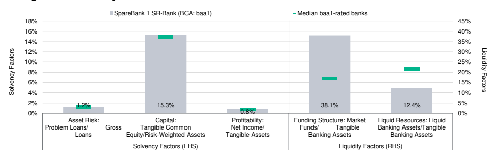
Exhibit 1 Rating Scorecard - Key financial ratios

The bank's A1 deposit and senior unsecured debt ratings take into account our Loss Given Failure (LGF) analysis of the bank's large volume of deposits and substantial layers of subordination, resulting in two notches of rating uplift. In addition our assessment of a moderate probability of government support results in one additional notch of rating uplift for debt and deposits.